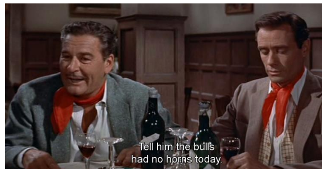
Figure 17, m. 80:37 – 80:57

Due to this change in the script the idea that every character personifies a bull is not as strong as in the novel. However, it gives a new interpretation. Now, Mike is saying that against Romero’s talent, it seemed that the bulls had no horns.