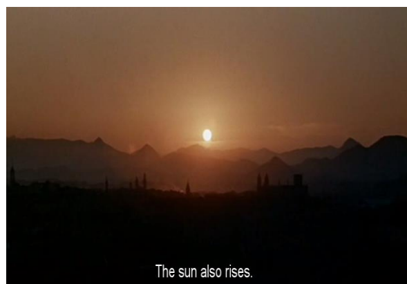
Figure 14, m. 120:11-120:14

At the end of the novel, Jake has learned to value and enjoy life for what it is, rather than suffer for what it cannot be. Hemingway uses Jake to show the reader that our lives are irrelevant compared to the eternal cycle of nature. The world endures and as the wounds of the world heal, the pain of Post-World war society will cure too. Instead, the film ends with the iconic repetition of the iconic epigraph which gives us the same sense of hope and room for improvement that the novel transmits. (Figure 14)