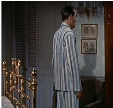
Figure 11, m.29:04