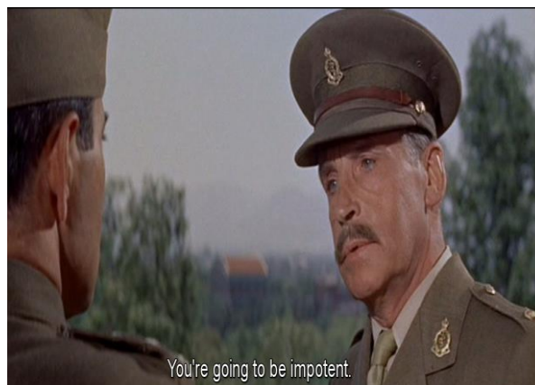
Figure 13, m.33:23- 33:30 7

Nevertheless in the novel represents Jake's cynic behaviour of defense against his condition: