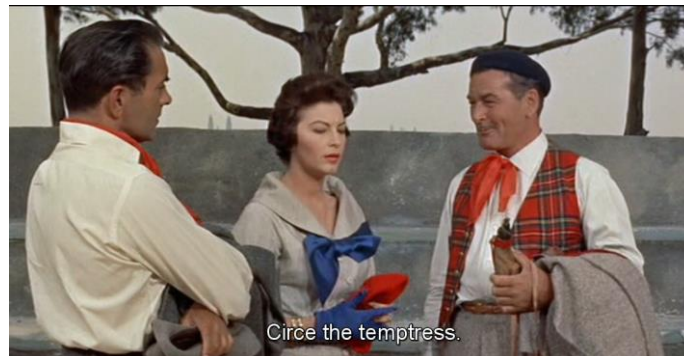
Figure 4, m. 62:06-62:08

Even though I have been underlining Brett's self-assurance, there are also some indications of insecurity in her actions, for instance, the sequence in which Jake is leaving the bar Brett is waiting at the door. Gardner transmits Brett's sadness with her expression, as if something is falling apart within her (Figure 5). This idea is strengthened by her reaction, she re-enters the pub and dances with the first man that she encounters. Through this scene the film is able to represent a crucial idea in the novel: even if Brett can have any man she wanted, she is in love with Jake mostly due to the fact that he is unreachable, she will never have him, and that frustrates her.