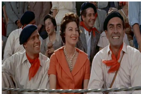
(Figure 10, m. 68:26-68:30).

Following this view, in the movie there is a clear victimisation of Jake, showing him distressed, almost depressive. We can establish a resemblance with the pyjama he is wearing and the striped uniforms used by prisoners in Nazi camps during World War II (Figure 11).