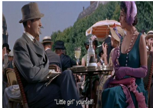
Figure 7, m. 7:42-15:01

An important theme dealing with masculinity issues in The Sun Also Rises is the depiction of homosexuality. For instance in the passage when Brett goes into the bar: