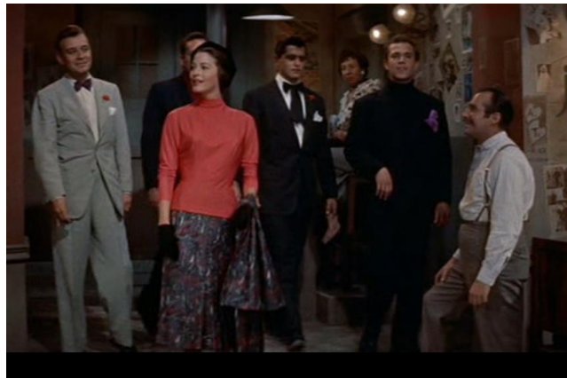
Figure 8, m. 16:33-17:28.

In this quote we can clearly see the antipathy that Jake feels for homosexuals, his portrayal of them as devoid of masculinity somehow responds to Jake's fear of being compared with homosexuals. As them, he is in fact emasculated, a more sensitive, delicate man. Jake is pursued by a model of masculinity he cannot fulfil, he is afraid of other men questioning his manhood. Such as Kimmel portrays that the "American men are socialized into a very rigid