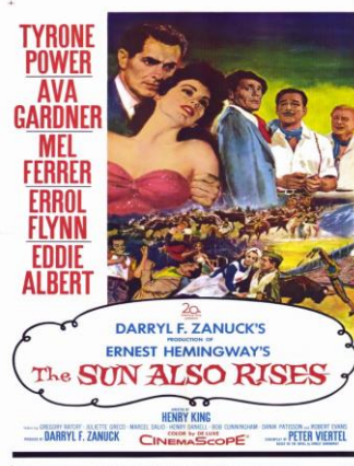
Poster of The Sun Also Rises (1957)

score among others). However, the movie seemed to fail in translating some of the transcendental themes that presumably made the novel a modern classic. Hemingway expressed his contempt for the adaptation of his work and he considered it “a splashy Cook’s tour ... of bistros, bullfights, and more bistros” (McFarland, 191).