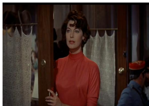
Figure 5, m. 27:10- 27:23

Even though I have been underlining Brett's self-assurance, there are also some indications of insecurity in her actions, for instance, the sequence in which Jake is leaving the bar Brett is waiting at the door. Gardner transmits Brett's sadness with her expression, as if something is falling apart within her (Figure 5). This idea is strengthened by her reaction, she re-enters the pub and dances with the first man that she encounters. Through this scene the film is able to represent a crucial idea in the novel: even if Brett can have any man she wanted, she is in love with Jake mostly due to the fact that he is unreachable, she will never have him, and that frustrates her.