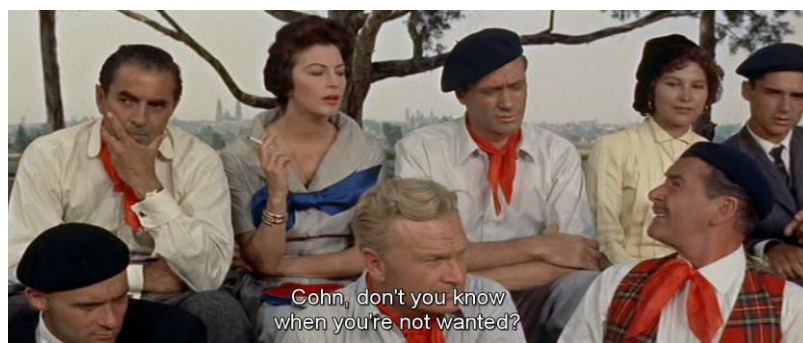
Figure 1: m. 61:10-61:20

Mike acknowledges that Brett has had affairs before but her affair with Cohn is much worse since he is a Jew, "What if Brett did sleep with you? She's slept with lots of better peo-