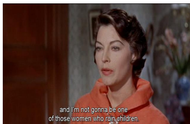
Figure 6, m.126:06-126:08

Censorship in the film also affected the character of Brett Ashley in some parts of the script; for instance she does not say “I’m not going to be one of these bitches that ruins children.” Instead she says, “I’m not going to be one of these women that ruins children.” (Figure 6).