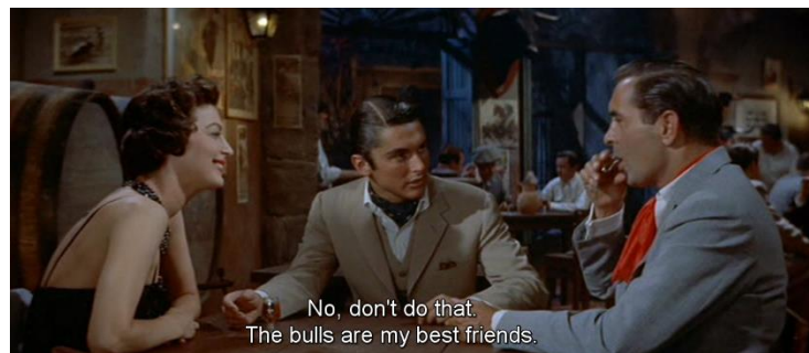
Figure 15, m. 89:04-89:13

This relationship of constant tension between the characters due to the opposition between masculine/feminine, the struggle between the two sets of masculinity and the high regard every single male character feels for Brett is important in both media. In the film, just as in the novel, we can see the idea that each male character is, indeed, a bull. This idea can be seen in an observation made by Jake, which is also present in the film (Figure 16)