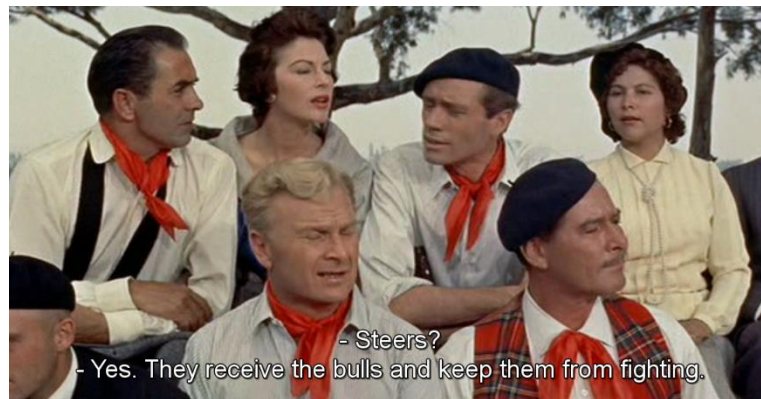
Figure 16, m. 57:12-57:43

This comment is crucial to understand the male/bull relationship, as the steers are sterilised bulls. There is a strong resemblance between Jake and a steer, not only due to the fact that both are emasculated, but also because both of them act as intermediaries in the fights between the males of the group. However, this idea is clearer in the novel due to changes in the film script. For instance, when they meet Romero in a restaurant, Campbell wants Jake to tell to Romero that “the bulls have no balls” (m. 80:37 – 80:57), indicating that Mike has been castrated by Brett. The screenplay substitutes “horns” for “balls.” Unlike in the novel, in the film we can listen to Mike crying “Tell him the bulls have no horns!” (Figure 17)