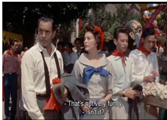
Figure 12, m. 56:05-56:25

The way in which Jake Barnes learns from an army officer he is impotent is different in the novel and the film (Figure 13). However, far more important for the question of fidelity is the way in which Jake behaves about it. In the film he seems troubled, miserable and disheartened: