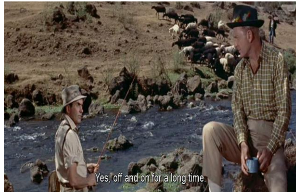
Figure 9 (m. 49:28-49:36)

To portray this sense of fulfilment, the film transposes Jake's mood through Tyrone Power's interpretation. He seems somehow happier, sometimes he even smiles and laughs. This enriches the film and strengthens the ideas that I have been dealing with. For instance when Mike Campbell gets into the corrida Jake cries of laughter with Brett while he bullfights with his check (Figure 10).