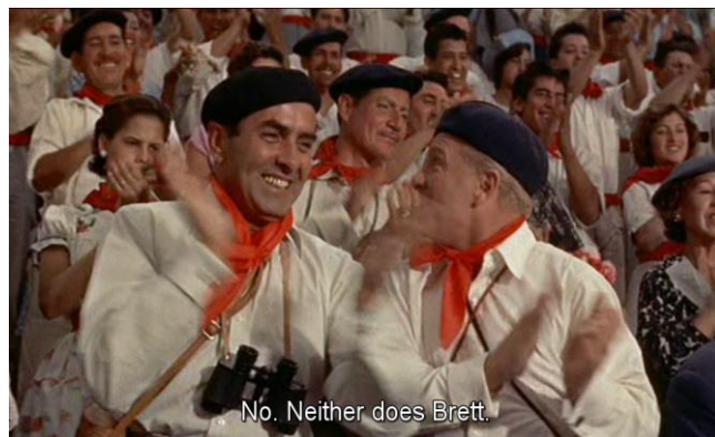
Figure 2, m. 80:23-80:25