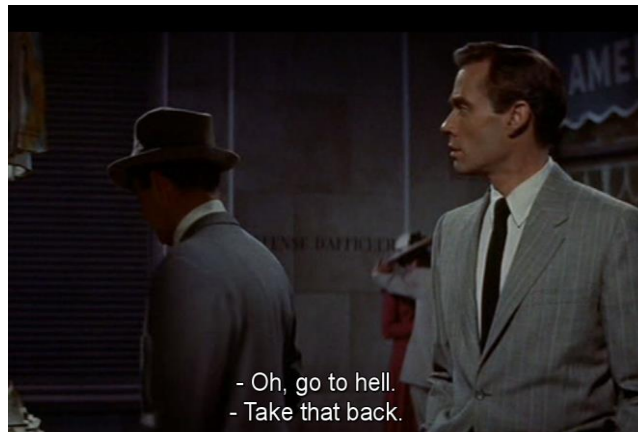
Figure 3: m. 28:20-28:45