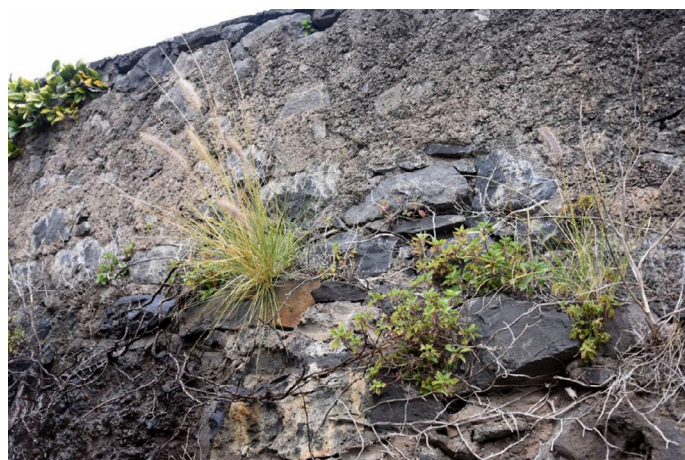
Figure 3. Pennisetum setaceum , individuals in a basaltic walls (St. Cruz).

a road (Figure 2), but also in cliffs and basaltic walls (Figure 3) including on a margin of a small brook, corresponding to highly hemerobic areas close to roads, houses and gardens. P. setaceum was the dominant plant, although this dominance was shared, in some cases, with other alien plants such as Pennisetum clandestinum , Ageratina adenophora (Spreng.) R.M. King & H. Rob. and Cardiospermum grandiflorum Sw. Cosentinia vellea (Aiton) Tod. (Table 1), a rare native fern in Madeira island, was found in chasmophytic invaded habitats.