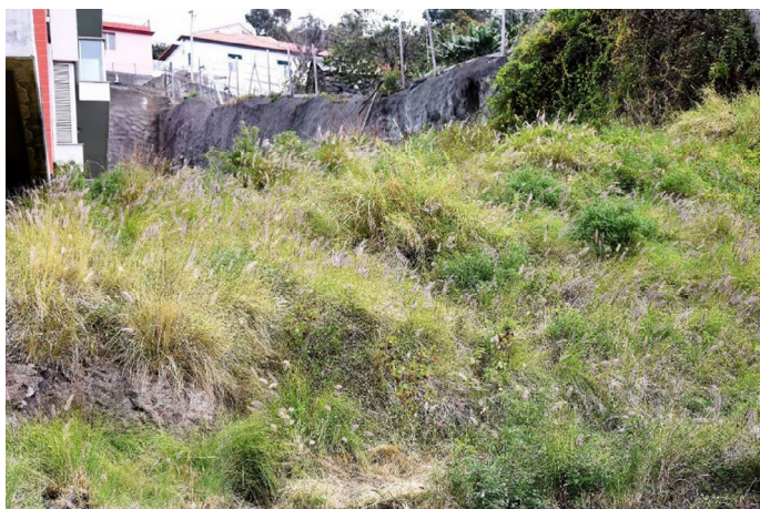
Figure 2. Pennisetum setaceum individuals forming dense tufts on a terrain (St. Cruz).