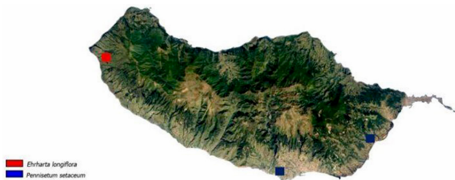
Figure 1. Distribution map of Ehrharta longiflora and Pennisetum setaceum .