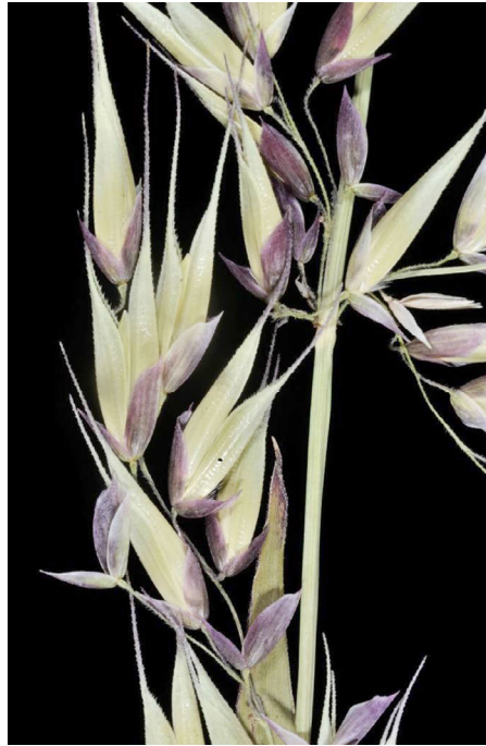
Figure 5. Ehrharta longiflora , detail of panicle.