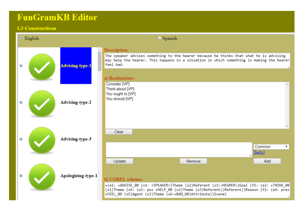
Figure 2: The Advising-Type 1 construction within the L3-Construction