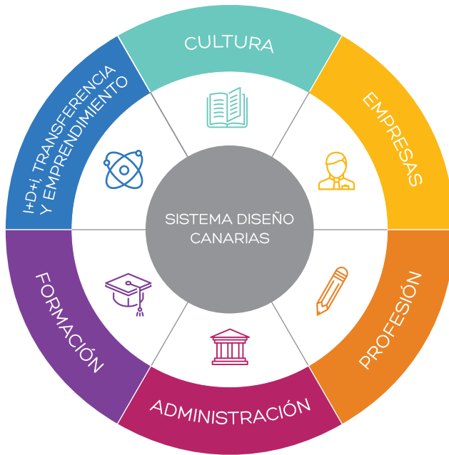
Canary Islands Design System model.

These have been the preliminary results from the PhD research. It is still a work in progress. Next steps research will be focus on the visual model refinement, together with its operability. It is necessary to find representation systems that help visualize the relationships between the actors of the Canary Islands Design System.