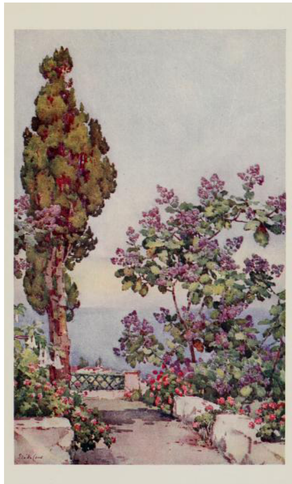
A Spanish Garden

Finally, in the last chapter related to the islands, she makes this comment about the island of Hierro, in which she states that the ones who seem to visit the island are just the botanists: “The vegetation is said to be of great interest to botanists, and they appear to be the only travellers who ever visit the island” (p. 159) She makes this statement due to the lack of facilities of the island. Hierro was quite uncomfortable because there was no sea-port and there were no accommodation, so the writer advises the readers to carry a tent if they are planning to visit it.