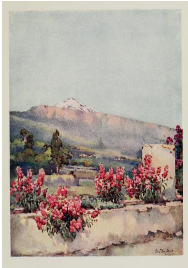
The Peak, from Villa Orotava

She describes not only natural landscapes, but also the view of the villages, categorizing Realejo Alto as the most picturesque one. We see how she compares with Italian locations and this comparison is influenced by her previous travel to Italy, as I mentioned in chapter 3. “The village of Realejo Alto is, without a doubt, the most picturesque village I ever saw in the Canaries. Its situation on a very steep slope with the houses seemingly piled one above the other is very suggestive of an Italian mountain village.” (p. 29).