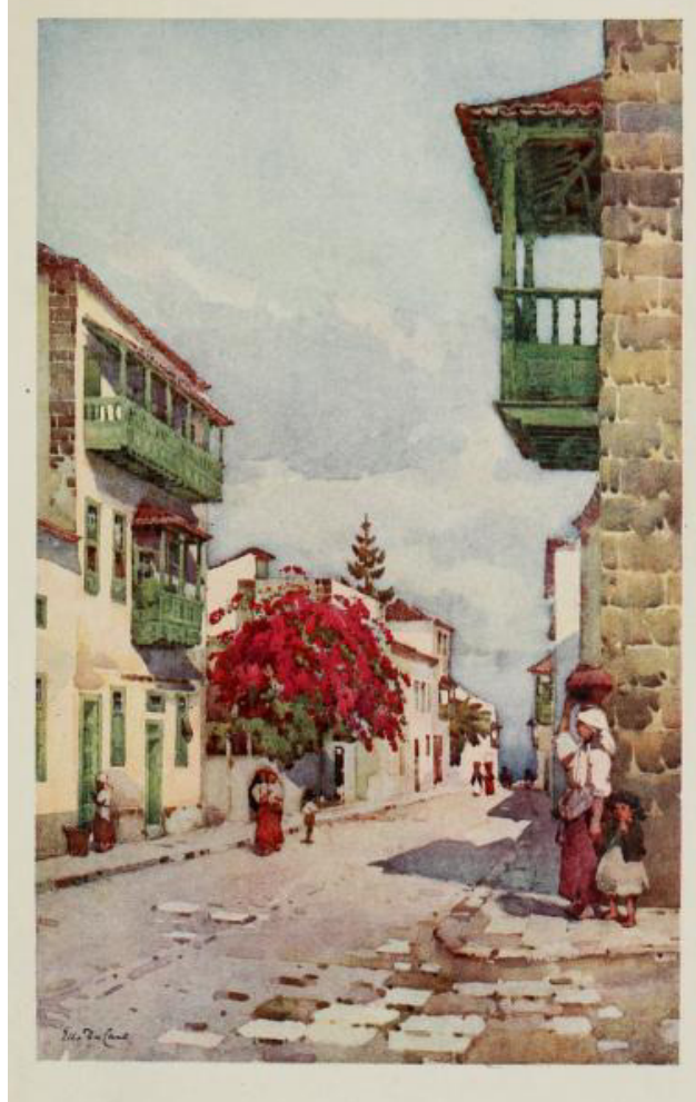
A Street in Puerto Orotava

The way people behave and live is an interesting topic that we found in many kinds of books, because it shows the reality of the times described. Descriptions of people show us how society has evolved throughout the years and it helps us to understand our life today. The analysis of people in travel books is very useful for sociology, because it does not only show how the people described behave, but also the opinions of the visitors and their points of view as foreigners. Probably, if we compare descriptions of Canary people written by a Canary writer would differ with those by British writers.