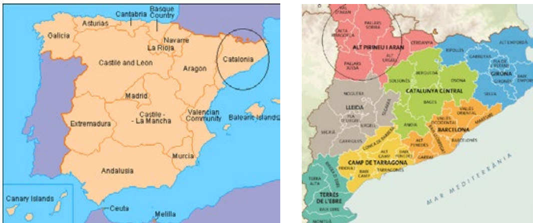
Figure 1: Geographic area