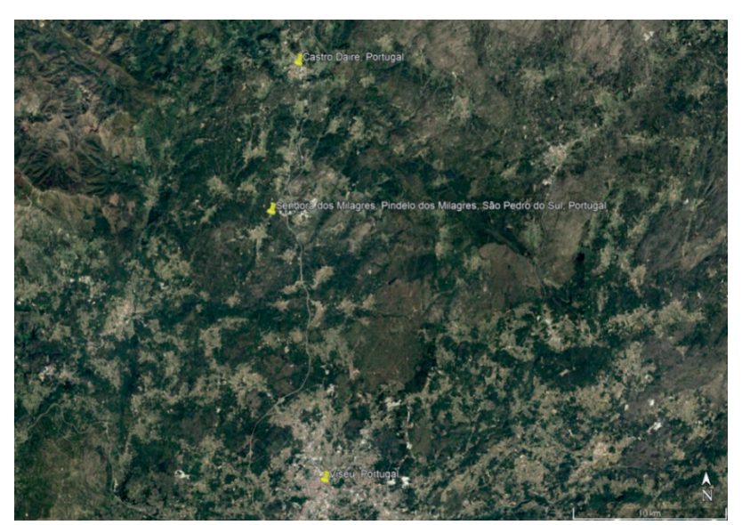
Figure 2: Location of the sanctuary of Senhora dos Milagres in the itinerary between Viseu and Castro Daire, Portugal

The catholic sanctuary of Senhora dos Milagres more or less in the middle of the route between Viseu and Castro Daire may be a strategic place to promote assistance to the pilgrims of the Camino (figure 2 obtained from the Google Earth (Google Earth, 2019).