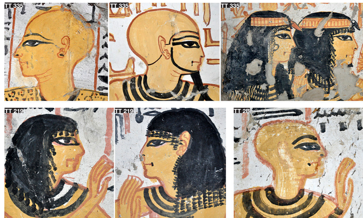
Figure 15. Details of faces in Nakhtamon (TT 335), Khabekhnet (TT 2B) and Nebenmaat (TT 219).

Once the differences are identified, we can go back to the main aim of this article: to identify the author of Sennedjem's tomb. Considering that the burial chamber of the chief of draughtsmen Pashed was decorated, certainly, by himself, and that the style he presents is similar to that of Sennedjem, it is possible to establish a clear artistic connection by attributing the decoration to one of the most influential artist of the gang. Among the workforce of the village would be Sennedjem, a gang colleague with whom he would have worked closely with in the tomb of Sety I and in the Valley of the Queens. Both were contemporaneous and their tombs matched in form and style. In this way, Pashed would have become the artist of one of the most well-known and memorable tombs at Deir el-Medina and the entire Nineteenth Dynasty.