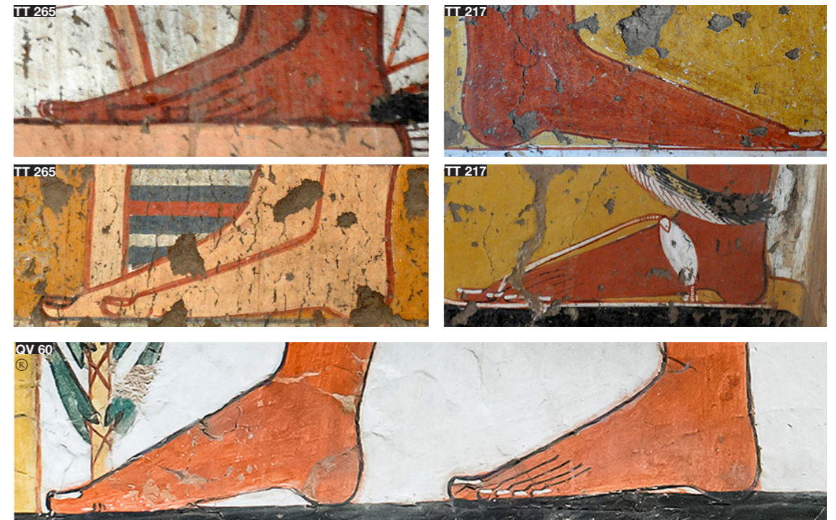
Figure.13. Details of feet and toes in Amenemipet (TT 265), Ipuy (TT 217) and Nefertari (QV 60).