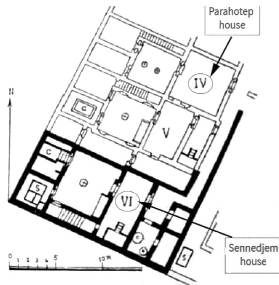
Figure 3. Sennedjem and Parahotep houses. Bruyère 1959: 6, fig. 3.

ly more elongated and pointed, a straighter nose that is occasionally somewhat pointed, and a more marked commissure of lips that outlines a slight smile (fig. 4, right).