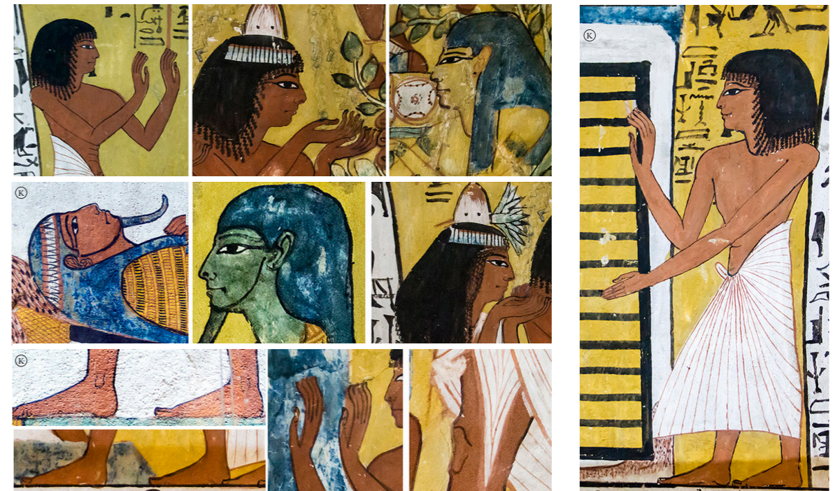
Figure 4. Tomb of Sennedjem. Left: small details of “Artist 1”. Right: “Artist 2”.

reach the Twentieth Dynasty and last until the end of village life at Deir el-Medina. 33 Moreover, this is the only tomb of a draughtsman preserved at the site. 34