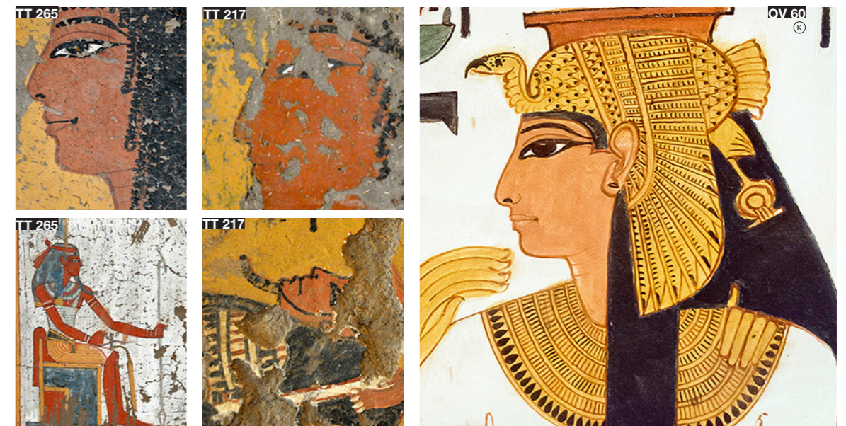
Figure.14. Details of faces in Amenemipet (TT 265), Ipuy (TT 217) and Nefertari (QV 60). Photographs by Kairoinfo4u image labelled ©) and by the author.