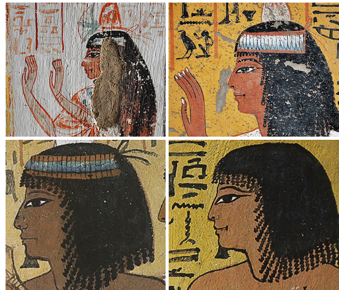
Figure 1. Comparison between the tomb-chapel of Amenemipet, TT 215 and his burial chamber TT 265 (upper part) and Sennedjem, TT 1 (lower part).

subtle differences in the facial features of the figures are noticeable, so the presence of a second painter should not be ruled out. The difficulty in distinguishing both hands could be due to the fact that it is the work of a master and an apprentice, perhaps father and son (see fig. 1, below).