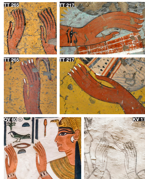
Figure.12. Details of hands in Amenemipet (TT 265), Ipuy (TT 217), Sety I (KV 17) and Nefertari (QV 60).

of the toes, elongated, with the nails and the lower wrinkles and, sometimes, with a visual perspective; as well as the facial features mentioned above, with slanted eyes of blank look (figs. 11, 12, 13 and 14).