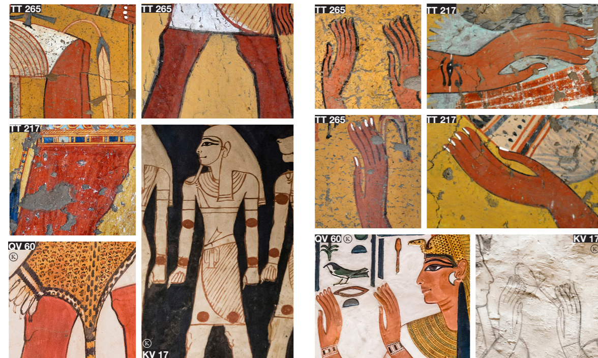
Figure.11. Details of knees in Amenemipet (TT 265), Ipuy (TT 217), Sety I (KV 17) and Nefertari (QV 60).