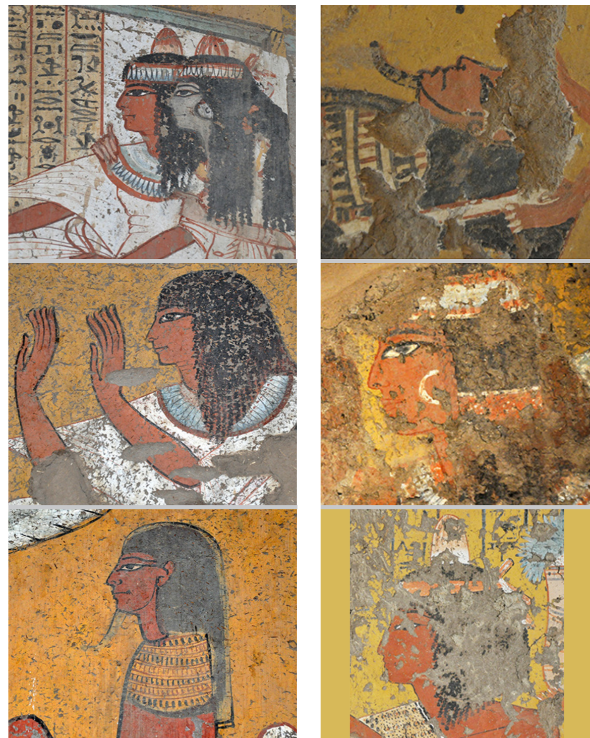
Figure 9. Burial chamber of Amenemipet (TT 265).