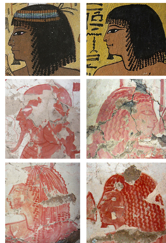
Figure 7. Comparative image of the two styles of the tomb of Pashed and the tomb of Sennedjem. The similarities in the profile of the figures show the hands of the same artists in both tombs.

"Artist 2" could be identified in most cases in Amenemipet's burial chamber (TT 265),