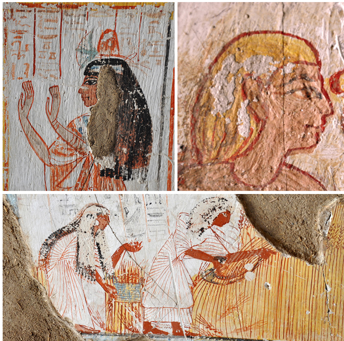
Figure 8. Tomb-chapel of Amenemipet (TT 215).

es II, such as the tomb of Ipuy (TT 217), 46 stylistic elements that remind us of our artist are found (fig. 10). In this case, the diversity of styles in the same tomb does not rule