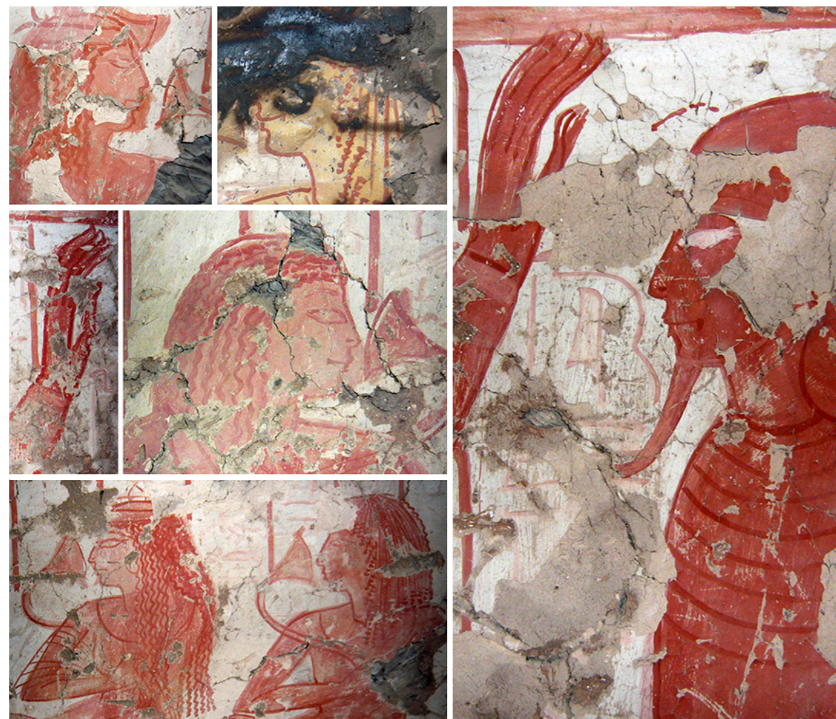
Figure 6. Details of the burial chamber of Pashed (TT 323).

his stela where the royal cartouche is depicted. 36 Regarding his home, Pashed's house was located in the northwest of the village, where a jamb of the chief of draughtmen and his wife, the "chantress of Amun" Neferitery, was found. 37 The role