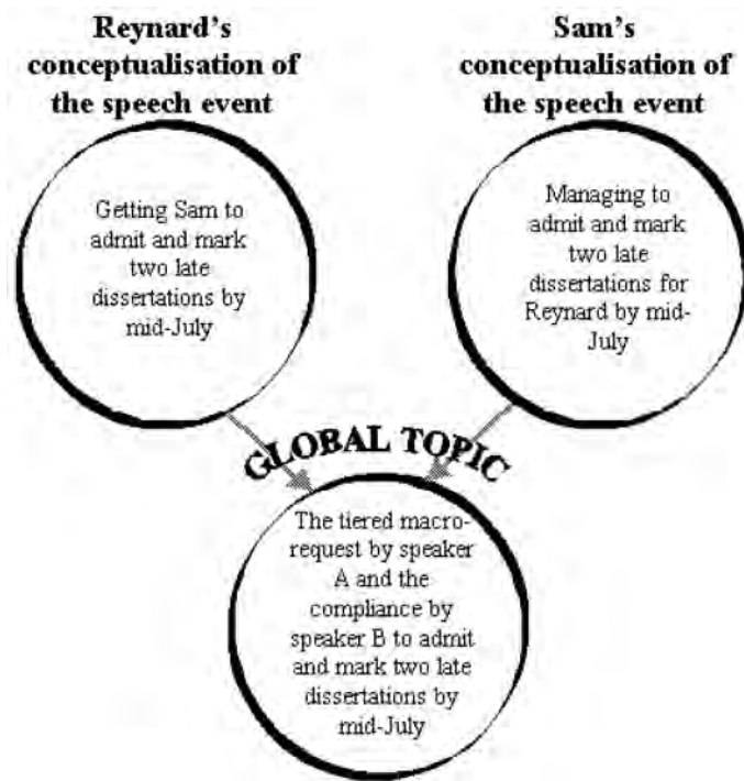
Figure 1. Convergence of the interlocutors' conceptualizations of the speech event, yielding the global Discourse Topic

request by A and compliance by B to admit and mark two late dissertations by mid-July (see Figure 1).