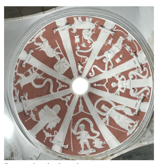
Figure 5: Dome in the Church of Saint Peter, late 16th century, Elvas.

The route based on applied motifs copied after Alciato should also include the Church of Saint Peter, in the south of the country. The temple located in the historic city of Elvas (UNESCO World Heritage) was erected in 1227, remodelled probably in the late 16<sup>th</sup> century and partially rebuilt after the earthquake in 1877. The Mannerist reform added the octave dome that covers the main chapel. It displays an exquisite decoration, having as central point a series of eight embossed white stucco figures on a brick coloured background, among labels and bows (Fig. 5).