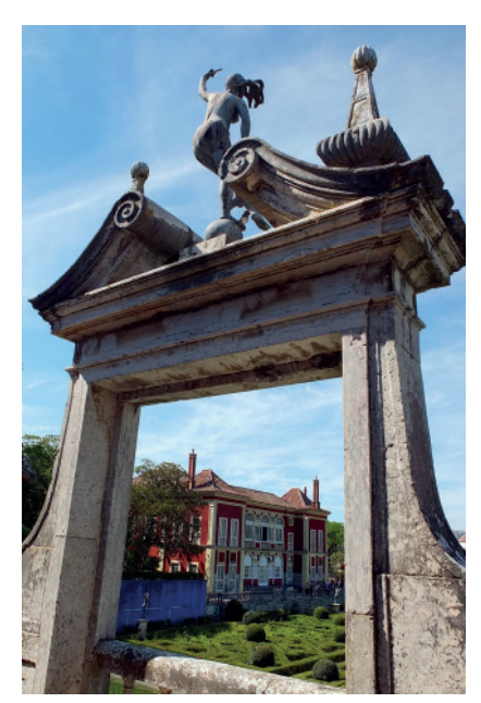
Figure 2: Statue of Occasio at the Garden of the Fronteira Palace.