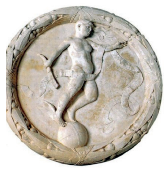
Figure 4: Emblematic medallion, attributed to Jean from Rouens, 16<sup>th</sup> century. Machado de Castro National Museum (Coimbra).