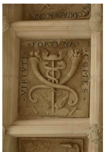
Figure 6: Emblem Virtuti Fortuna comes at Castle of Dampierre-sur-Boutonne.