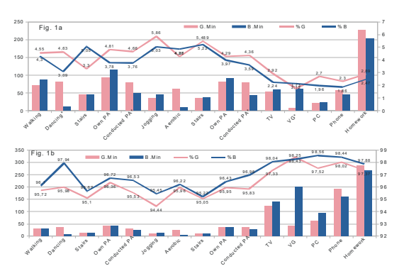
Figure 1. Average of time devoted to the considered activities according to sex (G=girls and B=Boys) and percentage of participant (%G=girls and %B=Boys) who followed the recommendations (Fig. 1a) or not (Fig. 1b) in PA, LA and ST, and (*) Significance p<.001), in t-test mean according to gender.

recommendations (WHO, 2018), only 107 participants meet the three requirements simultaneously, which is a total 2.6% of the sample. When looking at the activities these people do, significant differences are observed on Figure 1 regarding time devoted to PA, such as dancing, guided (moderate and vigorous), and video games; learning that girls devote more time to PA and boys to LA.