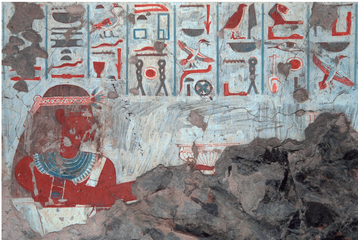
Figure 2. Detail of TT 29 with unfinished scene (Bavay, Laboury, 2012: fig. 19).

what can be said about other Egyptian sites? Could it be inferred that the artists from other parts of the country worked in a similar way to their Theban colleagues? The analysis of the decorated reliefs within the private funerary chapels from Tell el Amarna decorated with reliefs, developed by Gwil Owen and Barry Kemp, brought forward interesting data that complete and enrich our vision 14 . The study of several private tombs in the so-called Amarna South Cemetery revealed their unfinished state in various degrees depending on each funerary monument. There are tomb-chapels with hardly a few rooms excavated in which