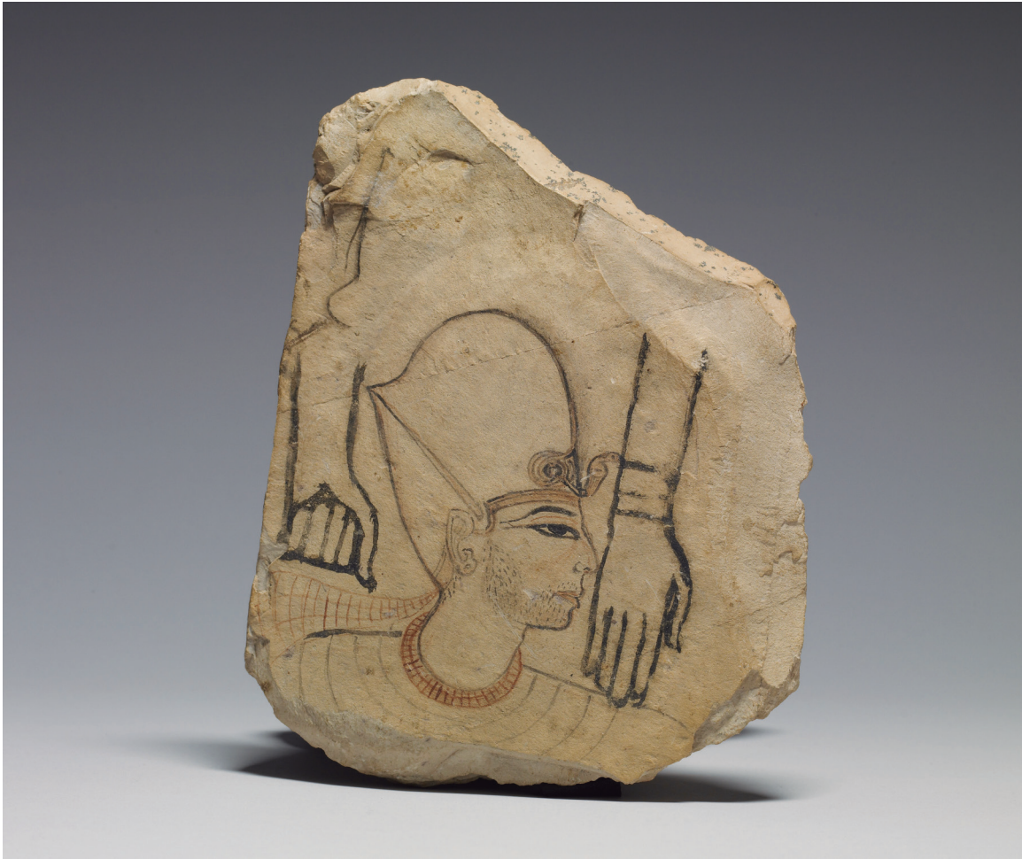
Figure 5. Ostraca with the image of a mourning pharaoh. Walters Art Museum, Baltimore, inv. nr. 32.1.

sources. Unfortunately, ancient Egyptians never left a legacy in the form of a text that can be considered an “art handbook” to show their artistic concepts. Nor did they show any special interest in describing the painters’ and sculptors’ work. In this sense, it is important to highlight a scene in the Theban tomb belonging to Tati, TT 154, (fig. 6), which shows a unique image of several individuals performing different tasks of the decoration of the tomb, similar to the