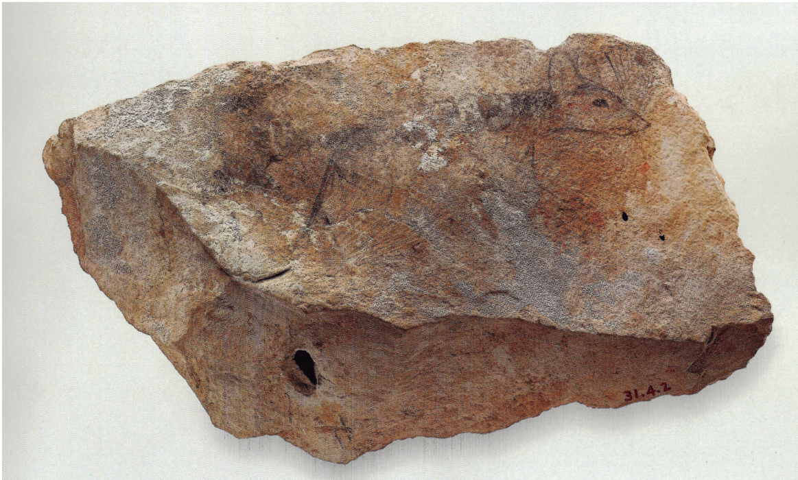
Figure 4. Reverse of the ostraca inv. nr. 31.4.2, with a figure of a rodent.

The detailed analysis of certain types of ostraca can offer interesting results, as shown in Jennifer Babcock's investigations of examples with animal representations also related to papyrus. Babcock analysed for example the so-called satiric ostraca with animal images performing human roles, tracking down the narrative in these objects and the potential connection with Egyptian folklore and fables, like the so-called Tefnut Legend. The study of ostraca with animals in human attitudes reveals a narrative potential, and they could have been used as complementary images when narrating Egyptian folklore and literature, given their excellent artistic quality and colour 39 . Unquestionably, it is a question of having a broad vision of the possibilities offered