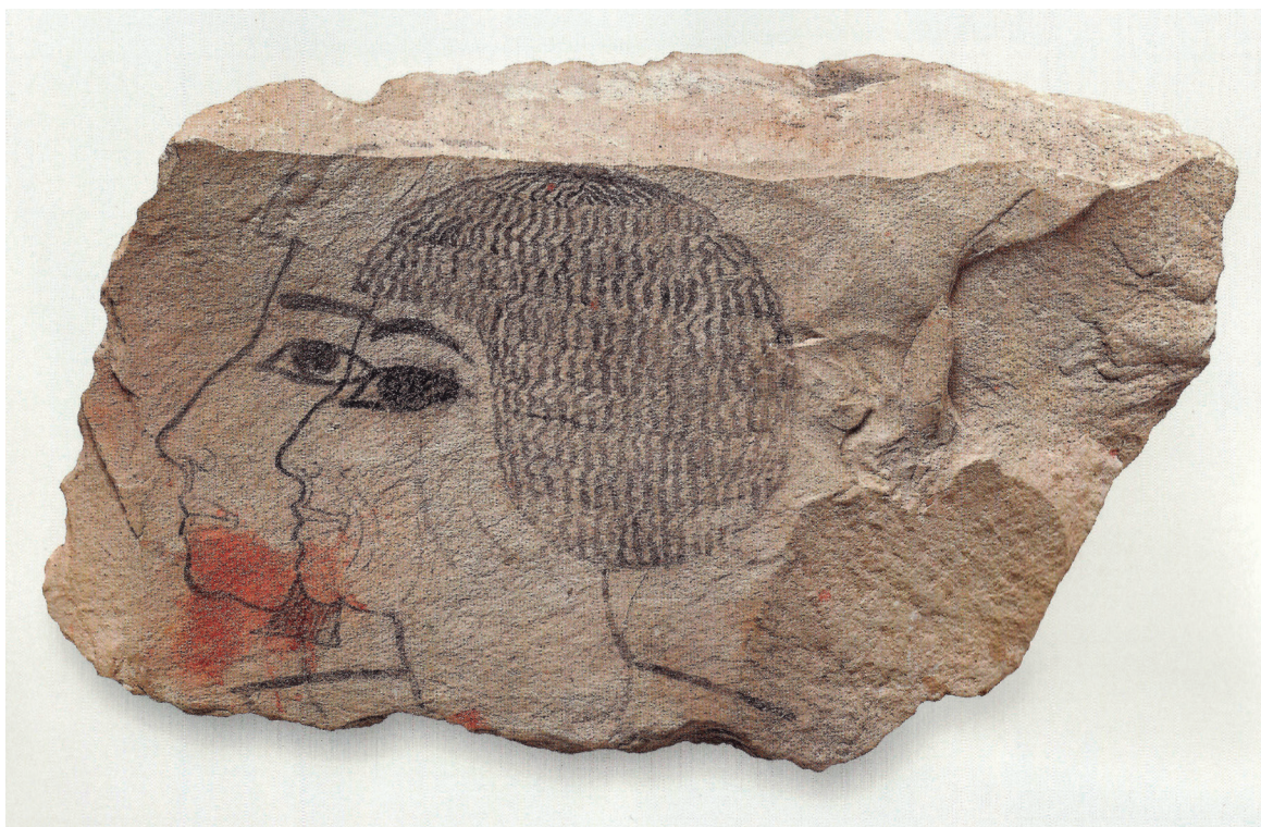
Figure 3. Ostraca with possible representations of Senenmut inv. nr. 31.4.2.

direct observation of an unusual fact, but probably never as a preparatory drawing of a tomb's scene.