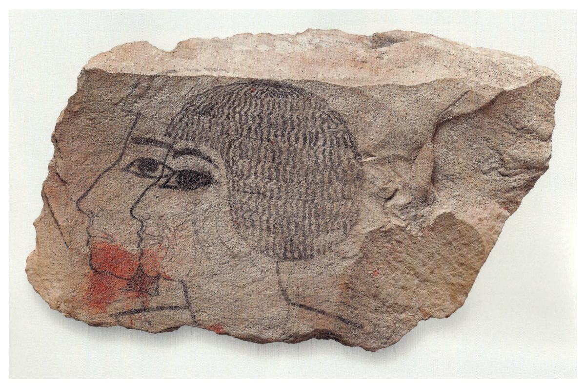
Figure 3. Ostraca with possible representations of Senenmut inv. nr. 31.4.2.

direct observation of an unusual fact, but probably never as a preparatory drawing of a tomb's scene.