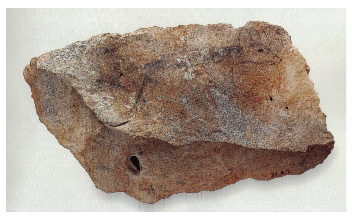
Figure 4. Reverse of the ostraca inv. nr. 31.4.2, with a figure of a rodent.

The detailed analysis of certain types of ostraca can offer interesting results, as shown in Jennifer Babcock's investigations of examples with animal representations also related to papyrus. Babcock analysed for example the so-called satiric ostraca with animal images performing human roles, tracking down the narrative in these objects and the potential connection with Egyptian folklore and fables, like the so-called Tefnut Legend. The study of ostraca with animals in human attitudes reveals a narrative potential, and they could have been used as complementary images when narrating Egyptian folklore and literature, given their excellent artistic quality and colour<sup>39</sup>. Unquestionably, it is a question of having a broad vision of the possibilities offered