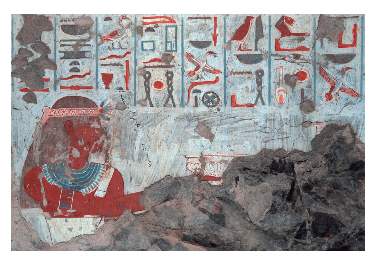
Figure 2. Detail of TT 29 with unfinished scene (Bavay, Laboury, 2012: fig. 19).

er, what can be said about other Egyptian sites? Could it be inferred that the artists from other parts of the country worked in a similar way to their Theban colleagues? The analysis of the decorated reliefs within the the private funerary chapels from Tell el Amarna decorated with reliefs, developed by Gwil Owen and Barry Kemp, brought forward interesting data that complete and enrich our vision<sup>14</sup>. The study of several private tombs in the so-called Amarna South Cemetery revealed their unfinished state in various degrees depending on each funerary monument. There are tomb-chapels with hardly a few rooms excavated in which