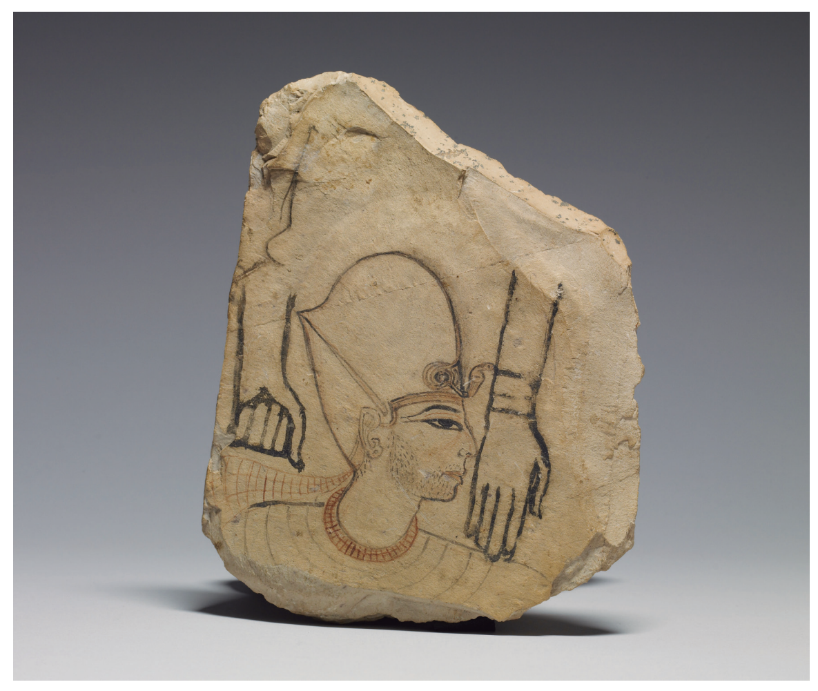
Figure 5. Ostraca with the image of a mourning pharaoh. Walters Art Museum, Baltimore, inv. nr. 32.1.

sources. Unfortunately, ancient Egyptians never left a legacy in the form of a text that can be considered an "art handbook" to show their artistic concepts. Nor did they show any special interest in describing the painters' and sculptors' work. In this sense, it is important to highlight a scene in the Theban tomb belonging to Tati, TT 154, (fig. 6), which shows a unique image of several individuals performing different tasks of the decoration of the tomb, similar to the