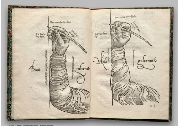
Fig. 1. Mercator, Literarum latinarum, quas Italicas, cursoriasque vocat, scribendarum ratio , Lovanio: Rutgerus Rescius, 1540.