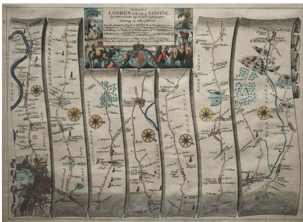
Fig. 2. John Ogilby, Strip map from the 1675 Britannia Atlas, showing the route from London to Bristol.

In this text from Mercator, the depiction of the arm acts as the main reference frame in order to explain the various aspects of “bona” and “mala gubernatio”. In this case the reference frame is based on a tridimensional representation, which helps the reader to elaborate the context of Mercator’s explanations. The typographical elements are activated and acquire meaning thanks to the reference frame “arm depiction”, which in turn becomes polarized and contextualized by the presence of alphabetic writings.