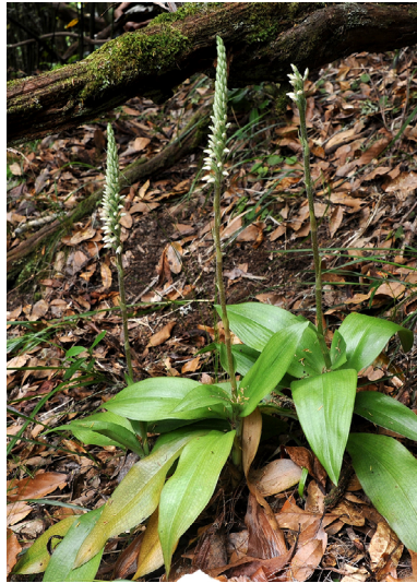
Figure 4. Goodyera macrophylla Lowe in its habitat.

As I have received the plates to Lowe's paper, I thought it w[oul]d be a pity not to forward them to you, & so shall entrust them to L. Jenyns who goes to Town tomorrow to send by some Plymouth Coach—They may be of service in directing your attention whilst collecting land shells (Henslow 1831, November 20).