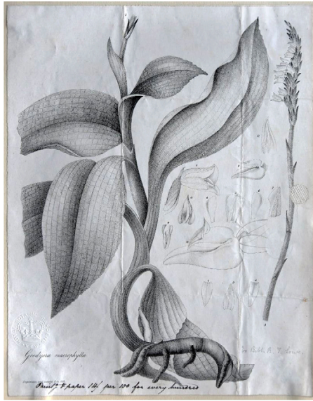
Figure 1. Goodyera macrophylla Lowe. Tab. I. Lowe, RT. 1831. Primitiæ faunæ et floræ Maderæ et Portus Sancti sive, Species quædam novæ vel hactenus minus rite cognitæ animalium et plantarum in his insulis degentium breviter descriptæ. Transactions of the Cambridge Philosophical Society 4: 1-70; pl. 1-6.