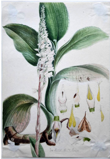
Figure 2. Goodyera macrophylla Lowe. Watercoloured drawing by Richard Thomas Lowe.