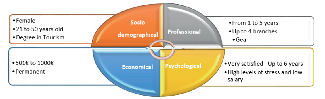
Figure 2: Travel agent profile in Portugal

From the results obtained through the empirical component, it was possible to characterize the profile of the Portuguese travel agent in four elements: sociodemographical, economical, professional and psychological, which are possible to visualize in figure 2.