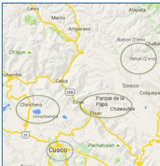
Figure 2: The Cusco region. The map shows the city of Cusco and other rural places mentioned in the article. Note that each Peruvian region, like Cusco, is divided into provinces and districts.

Cusco region's incidence (57.4%; the national incidence is 39.3%). 8 It is noteworthy that women weavers in Chinchero do not have the same socio-economic status. As we will see in this paper, some are better off than others, particularly those who have the economic capital to become entrepreneurs while others remain workers. However, it would be hard to draw up socioeconomic profiles for each interviewed person, since the research was performed in textile centers, paying less attention to their living conditions. The latter could have been possible to observe if I would have conducted research within households to better understand and compare weavers' particular socio-economic situation. As I will highlight in the conclusion, it would have been helpful to contrast discourse on women's empowerment with actual changes within households.