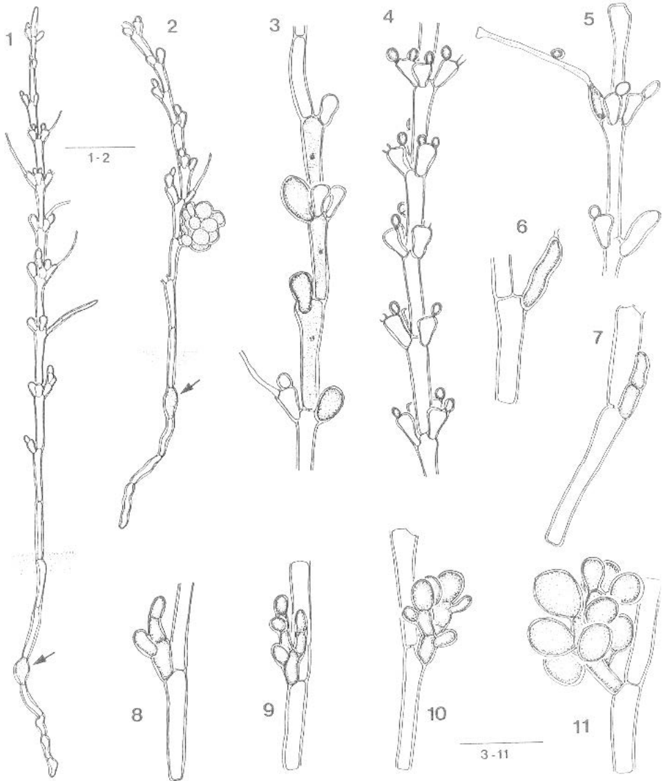
Figs 1-11. Colaconema ophioglossum . Figs 1, 2. Habit of two specimens showing endophytic irregularly contorted filaments with a persistent globose spore (arrows) and simple erect filaments. Scale bar = 50 \mu m. Fig. 3. Detail of an erect filament with monosporangia. Note a single lobate parietal chloroplast with a single pyrenoid in each cell. Fig. 4. Detail of an erect filament with spermatangia formed in pairs on stalk-cells arranged in whorls. Fig. 5. Detail of a carposogonium. Fig. 6. Extended base of fertilized carposogonium. Fig. 7. First transverse division of the carposogonium. Figs 8-10. Early developmental stages of carposporophytes with young gonimoblasts growing monopodially. Fig. 11. Mature carposporophyte with terminal subspherical carposporangia. Scale bar for figures 3-11 = 20 \mu m.